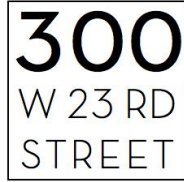
EXHIBIT "F" TO THE ALTERATION AGREEMENT CONSENT AND NOTICE TO PROCEED